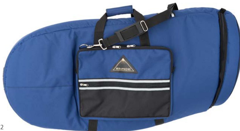
Gigbag for tuba