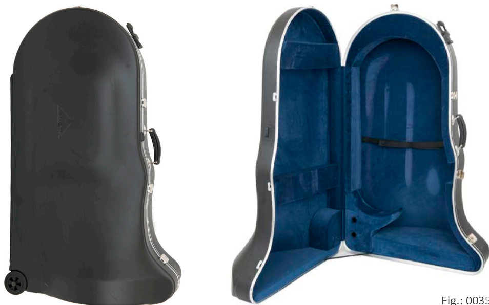
Case for BBb tuba 98 Siegfried and 497 Hagen