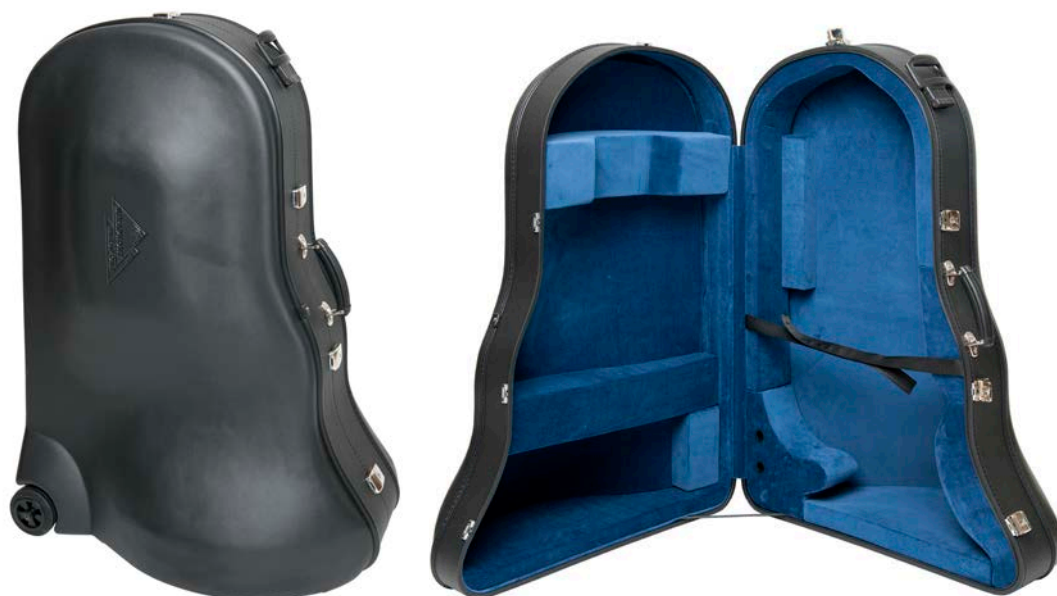
Case for BBb tuba 91, 1291